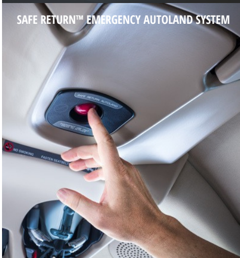
SAFE RETURN™ EMERGENCY AUTOLAND SYSTEM